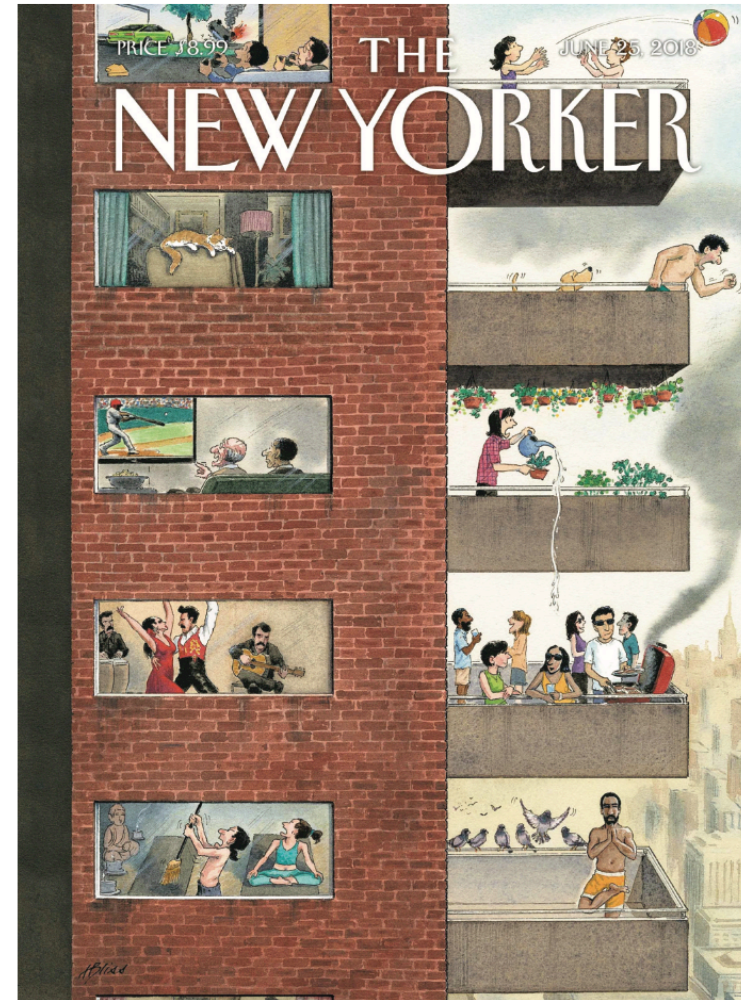
Cover 'City Living', June 25th, 2018 issue of The New Yorker Trademark of Advance Magazine Publishers Inc © Conde Nast

Section 4: Use the cover of The New Yorker magazine as the basis for a piece of imaginative writing to be included in a collection of short stories called 'Through the Window'.